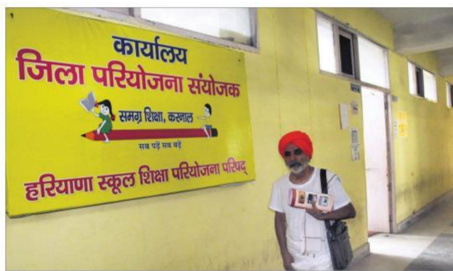
The Education Department has started an online transfer drive, which was long awaited.

The data says, there are 77,767 students from Class VI to XII. Of them 36,918 are between Classes VI and VIII while 23,312 are in Classes between IX and X, and