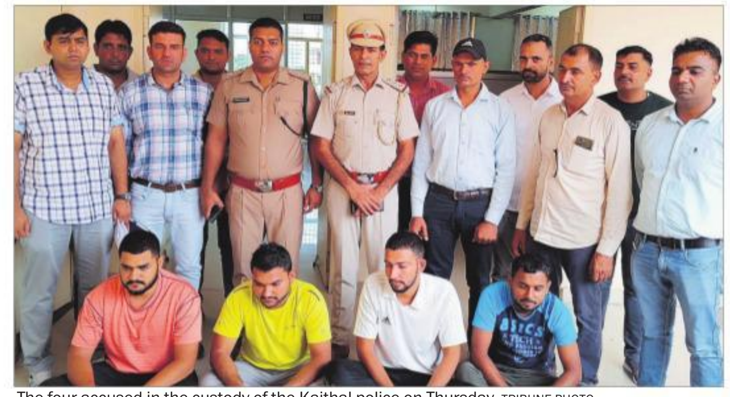
The four accused in the custody of the Kaithal police on Thursday.

Hooda said the committee on agriculture in the Congress Navsankalp Manthan Shivir at Udaipur had also mentioned the crop insurance scheme and its recommendations. The committee formed under Hooda's leadership had recommended that the government should take up the work of crop insurance.